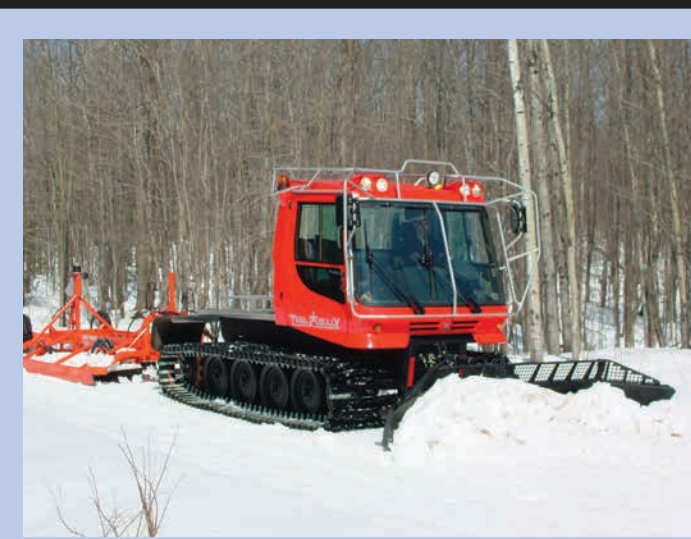
2012 & 2016 Pisten Bully's

These groomed trails link Rhinelander, the "hub" of snowmobiling, with the following areas: Tomahawk, Lake Tomahawk, Minoqua, St. Germain, Eagle River, Three Lakes, Sugar Camp, Monico, Crandon and Pelican Lake to Antigo.